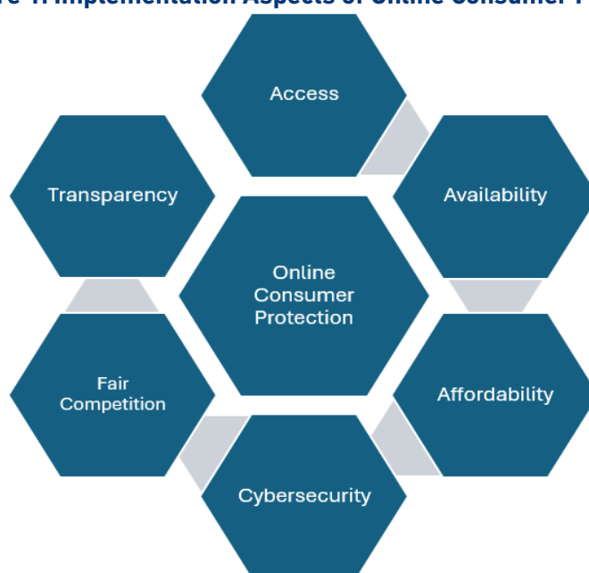
Figure 1. Implementation Aspects of Online Consumer Protection

While there is currently no common ASEAN framework for online consumer protection, the ASEAN Strategic Action Plan on Consumer Protection supports the modernisation of laws across member states to encourage harmonisation. These efforts focus on aligning legal frameworks, facilitating online dispute resolution, and promoting secure cross-border transactions. Key initiatives include the Guideline on Online Dispute Resolution for Consumers , the Guideline on Accountabilities and Responsibilities of E-Marketplaces , and the Online Business Code of Conduct . These serve as foundational building blocks for harmonising online consumer protection across the region. Additionally, they reinforce specific e-commerce safeguards, such as consumer privacy and cross-border dispute resolution, in line with ASEAN's vision of fostering a dynamic and competitive regional digital economy.