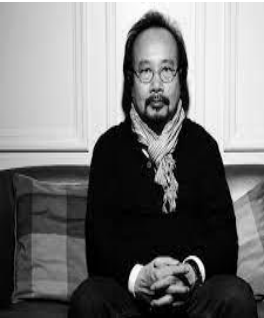
Rithy Panh Filmmaker