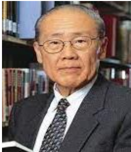
Wang Gungwu Historian and University Professor, National University of Singapore