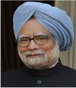
Manmohan Singh Former Prime Minister, Republic of India