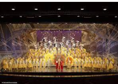
Takarazuka Revue Japanese Theatrical Company