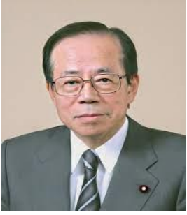
Yasuo Fukuda Former Prime Minister, Japan