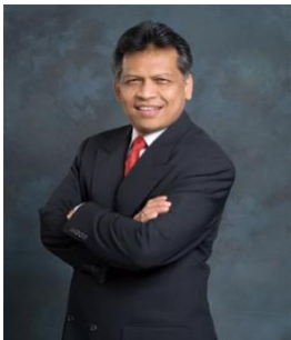
Surin Pitsuwan (1949–2017) Former Secretary-General, Association of Southeast Asian Nations